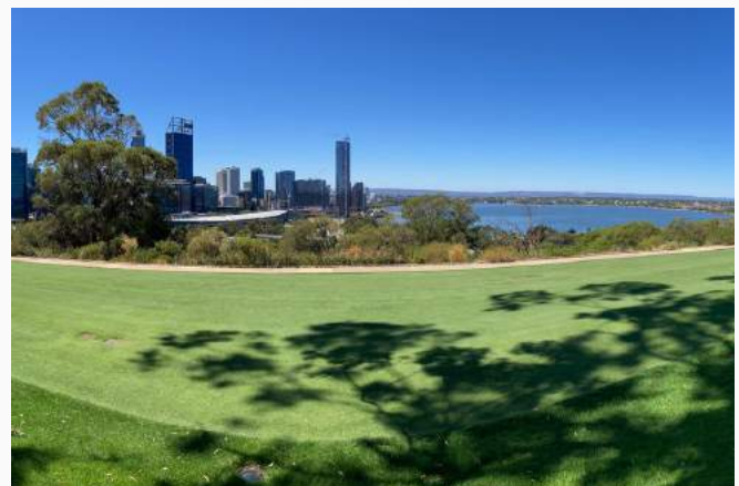
Kings Park panorama