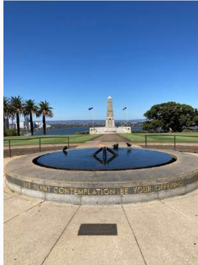
State War Memorial