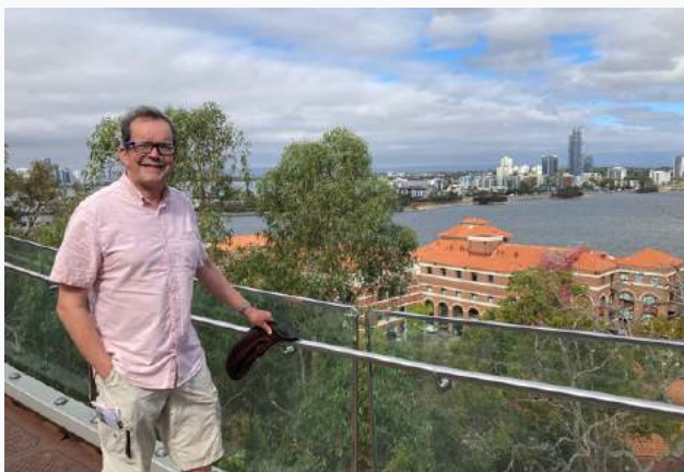
Walkway overlooking Swan River