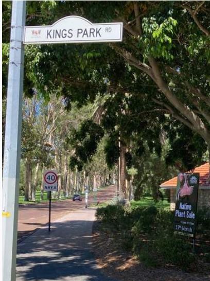
Kings Park Road (plant sale by Friends')