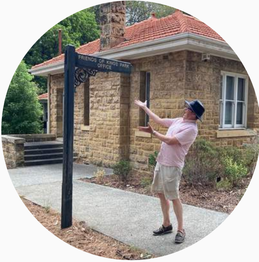
Friends of Kings Park Perth office